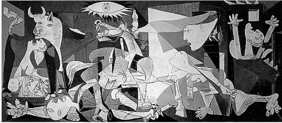
Fig. 2 – Picasso’s Guernica , 1937.